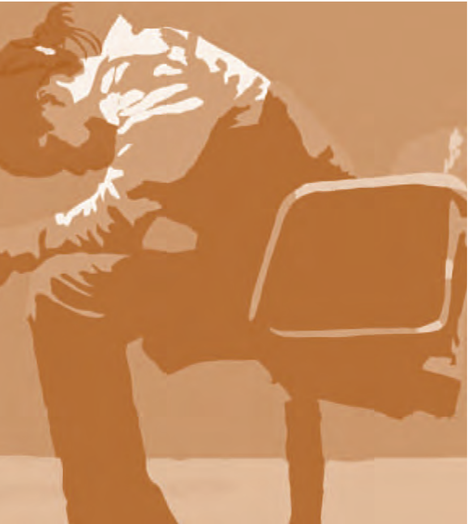
Illustration by HCC student D. Sule