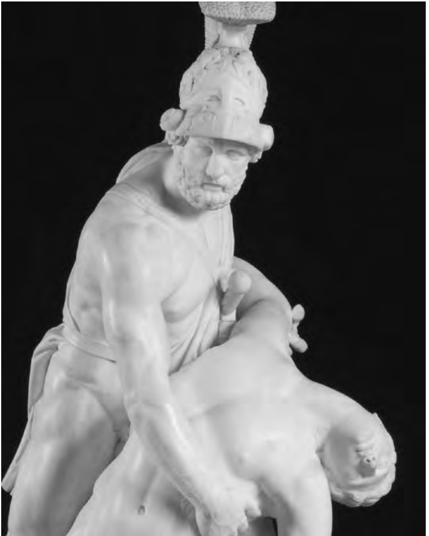
Troy , (detail) from the Housatonic Museum of Art collection