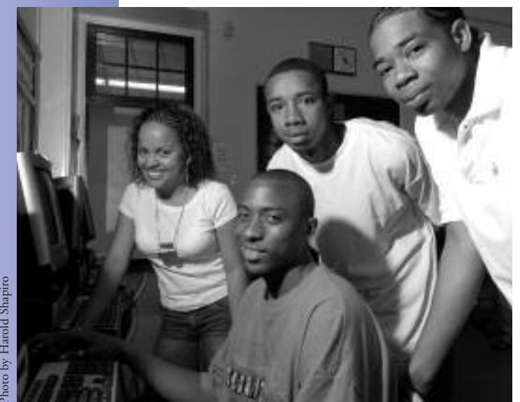
Students from Bridgeport's Bassick High School

Last May, Housatonic Community College faculty and staff completed the development of an important new pilot program in partnership with Bridgeport's Warren G. Harding and Bassick High Schools. This Pilot Program will address the serious problems faced by students who enter the College with academic deficiencies that seriously limit and often prevent their achievement in the college classroom and subsequently, their successful entry into the workforce.