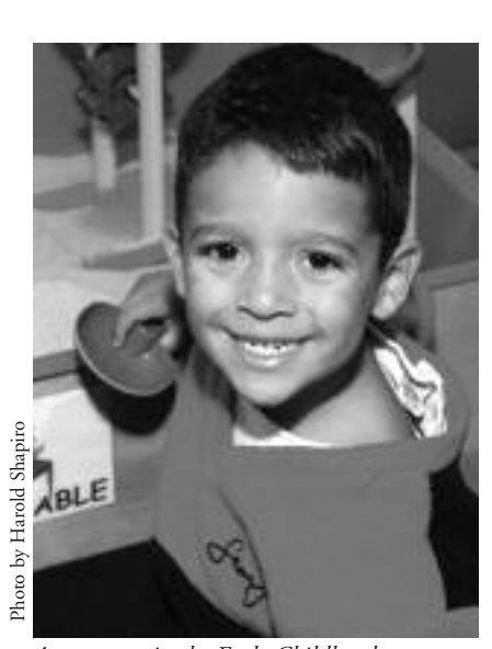
A youngster in the Early Childhood Laboratory School Program

The Westport Young Women's League continues to be a strong supporter of the HCC Foundation and our students. The organization awarded a grant of $6,000 to support The Early Childhood Laboratory School, including the cost of field trips and childcare for twenty students. This is the ninth year that the Young Women's League has supported the Foundation.