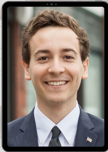
SENATOR WILL HASKELL