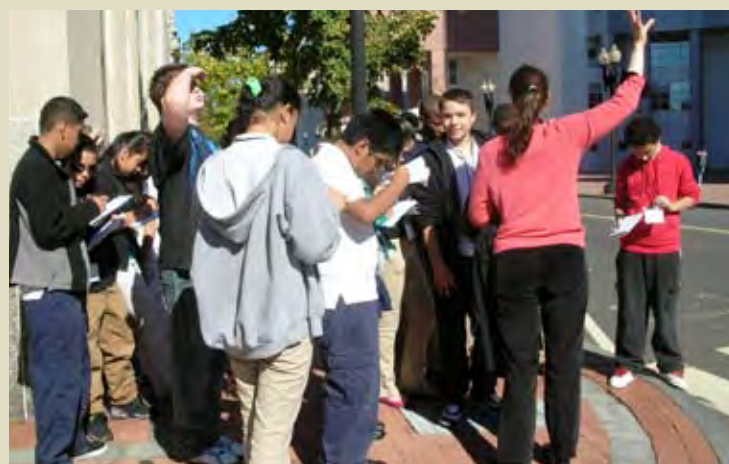
Students in the Werth Peer Docent Program learned about the rich architecture in the City of Bridgeport.

The Housatonic Museum of Art (HMA) is home to one of the premier community college art collections in the United States. Its collection offers students and the community alike the opportunity to view works that span the history of art from the ancient to the contemporary. This permanent collection is on continuous display throughout the 300,000 square foot College, offering a rare opportunity for serious art enthusiasts, students and faculty, and casual observers to view and interact with art every day.