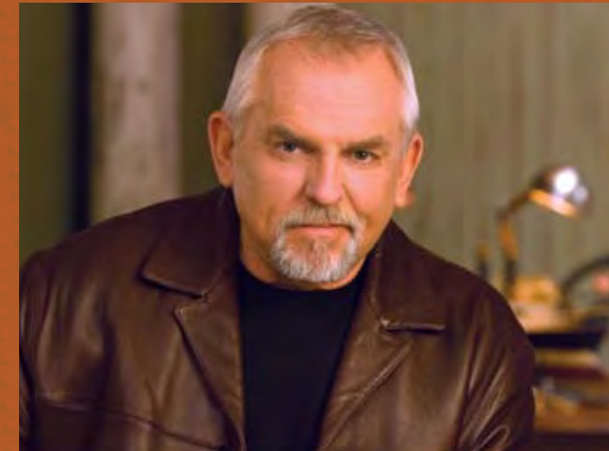
Actor and manufacturing advocate, John Ratzenberger, has agreed to be the inaugural chairman of the steering committee for the HCC Foundation's new American Manufacturing Hall of Fame.