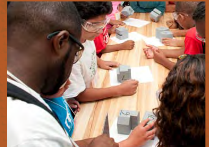
Students from the Shehan and McGivney Community Centers who attended the American Manufacturing Hall of Fame kick-off event worked on a manufacturing exercise before touring the HCC Advanced Manufacturing Center.